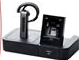
Jabra GO 6470