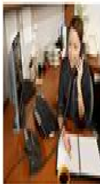
Applies to phones running SIP 2.2 or later