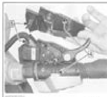
Image 6: Check engagement of housing cover steering and throttle Step 6: Ensure engagement of cover housing steering and throttle