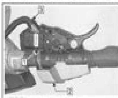
Image 5: Position wiring & properly routed Step 5: Press housing cover Step 6: Press proper corrugated conduit positioning