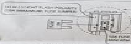
Remote Start 10-pin Harness