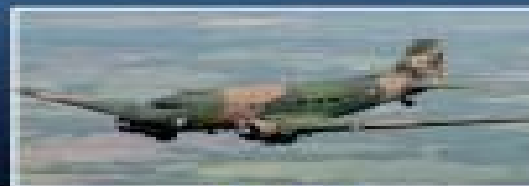
AC-47 THE FIRST GUNSHIP