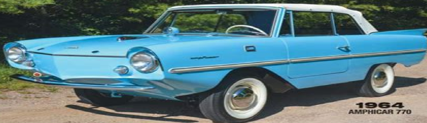
1964 AMPHICAR 770