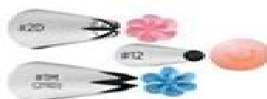
Extra Large Tip Set