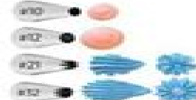
Round 10 and 12/ Star 12 and 21 Set