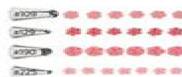
Drop Flowers Tip Set