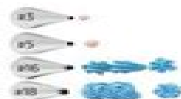
Round 3 and 5/ Star 16 and 18 Set