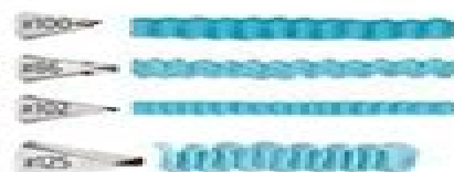
Ruffles Tip Set