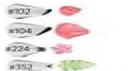
Petal 102 and 104/ Leaf 352/Flower 224 Set