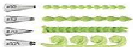
Borders Tip Set