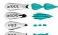
Specialty Tip Set