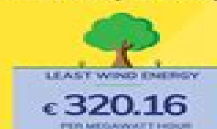
MONTHLY PRICE COMPARISON