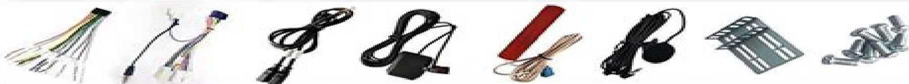
1xPower cable 1xPower cable 1xUSB 1xGPS Antenna 1xWiFi Antenna 1xExternal Microphone 2xInstallation bracket 5xInstallation Screws