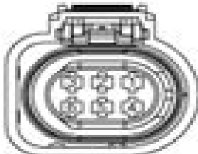
C108 HO2S (B1/S1)