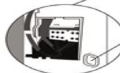
Manual Control Button (Forced cooling)