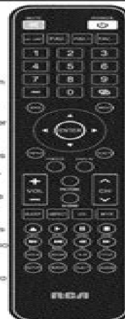
Remote control part number 62290900

VOL+ or VOL-: Increases or decreases the TV