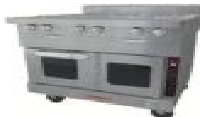
Model TVDS-22SC or 32SC