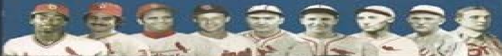
McGee Hernandez Torre Mauer Mike Medwick Hefner Hornsby Burkett