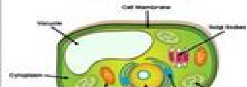
Structures of a Plant Cell