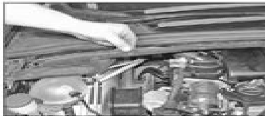
10.2b ... and the sound insulation material