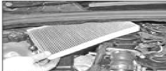
10.4 Slide the pollen filter out from the bulkhead