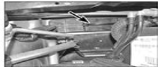
10.3a Pull the filter cover (arrowed) ...