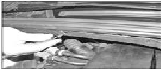
10.2a Remove the retaining clips ...