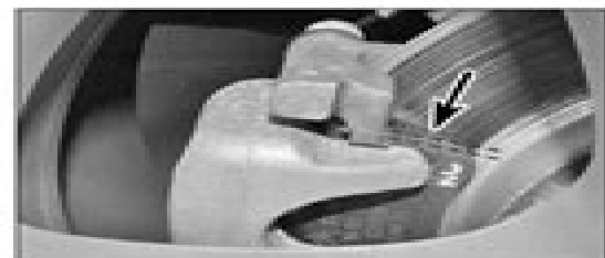
11.3 Checking brake pad thickness through alloy wheels