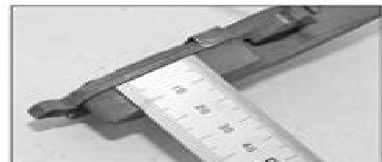
11.7 Check the thickness of the brake pad friction material

9 If any disc is thinner than the specified minimum thickness, renew both (refer to Chapter 9, Section 6).