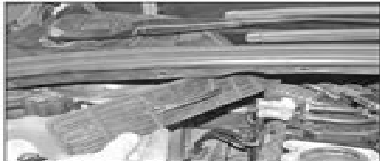
10.3b ... and withdraw it from the bulkhead