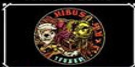
Mer 13267 Ming