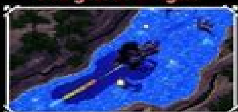
Brng Sampet Pi50/58 Mom Mxill Tinglexy