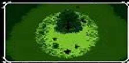
Thig Evar Yilm