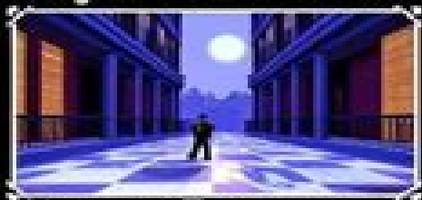
Mald of Tompacting