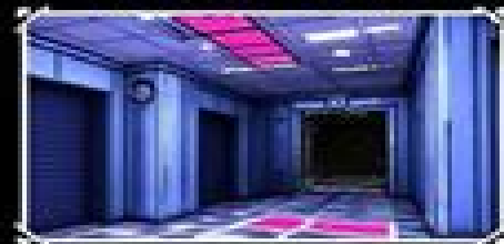
Prus on Oter Ia