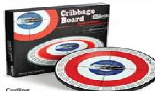
Curling Cribbage Board Glow in the dark and features the rings of a curling rink.