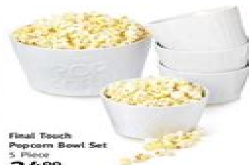
Final Touch Popcorn Bowl Set 5 Piece