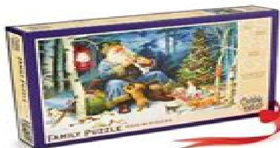
Cobble Hill Family Puzzle 400 Pieces