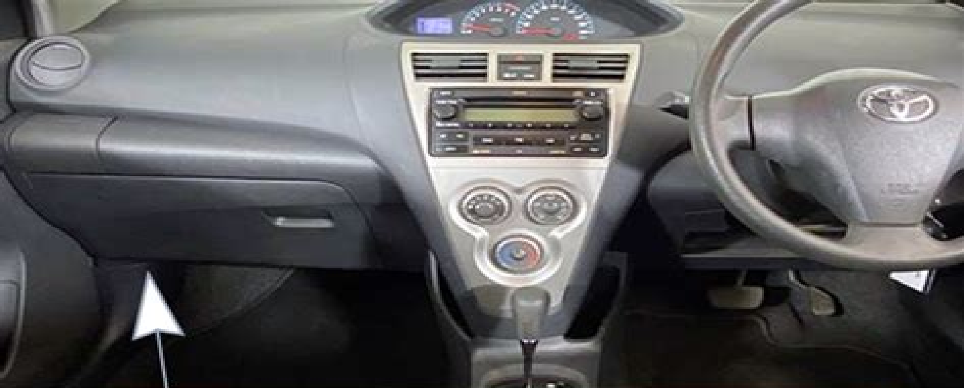
Instrument Panel Fuse Box