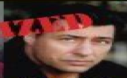
Travolta's Stunt Double