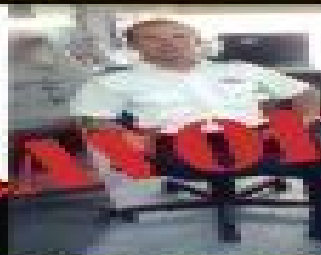
The Cruise Ship Worker