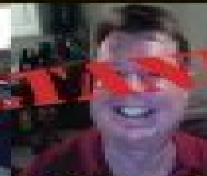
The Disneyland Concierge