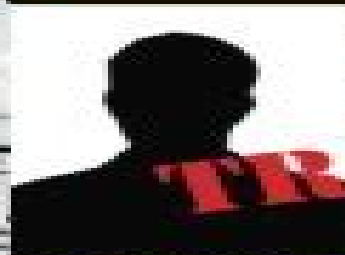
The Boyfriend 6 years