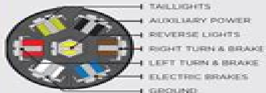
7 BLADE (RV STANDARD)