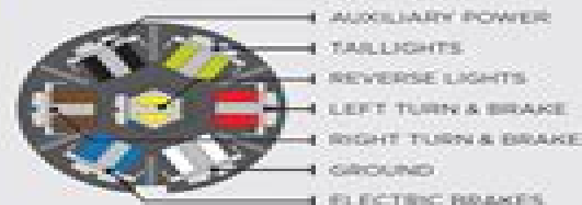
7 BLADE (RV STANDARD)