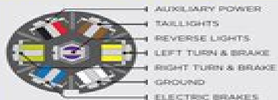
7 BLADE (SAE STANDARD)