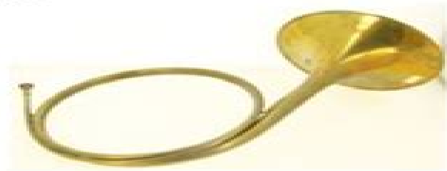
Le cor de chasse