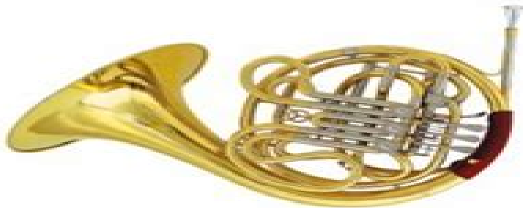
Le cor d'harmonie