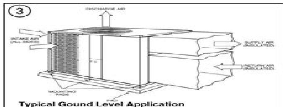
Typical Ground Level Application

The unit must be isolated with mounting pads. The mounting pads must provide a minimum of 1/4" clearance beneath the unit to permit air circulation and prevent corrosion of the base. See Figure 3.