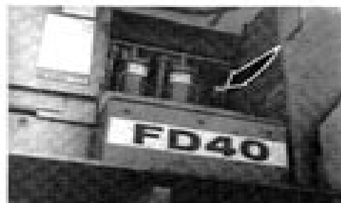
FIG.3 MASTER SWITCH LOCATION T-83112