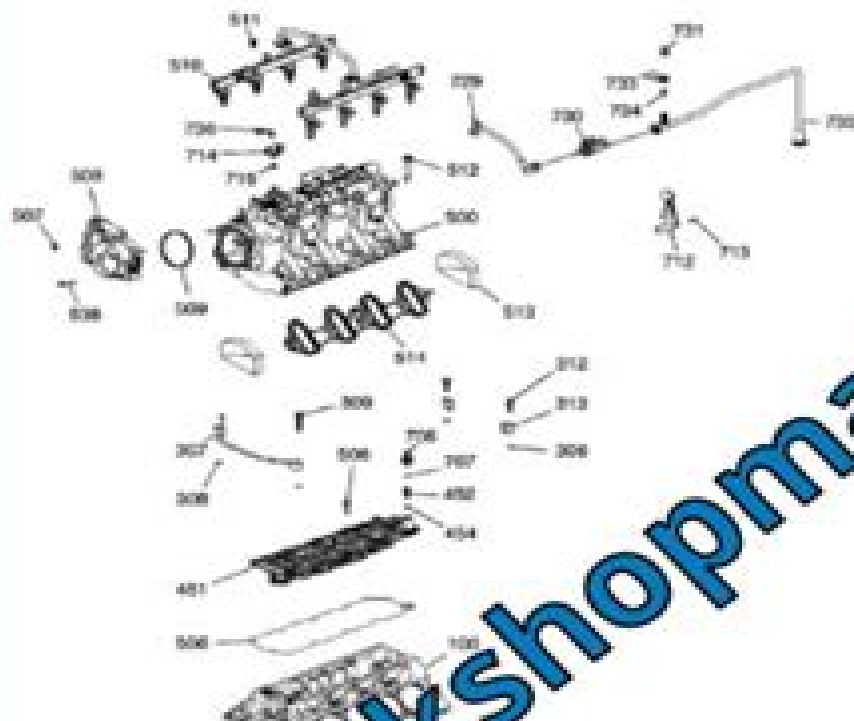
Fig. 6: Intake Manifold Upper Engine