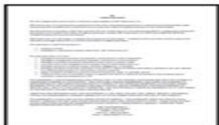
Warranty Card x 1pc