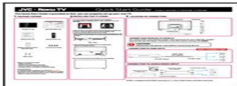
Quick Start Guide x 1pc