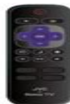
Remote Control x 1pc