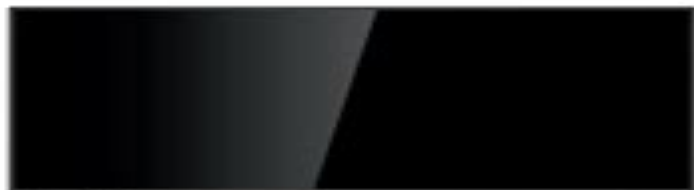
JVC Roku TV x 1pc