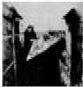
Première photo de l'histoire prise par le français Nicéphore Niépce 1827