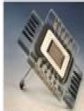
L'invention du Capteur CCD par le canadien Willard Boyle et l'américain George Smith 1969