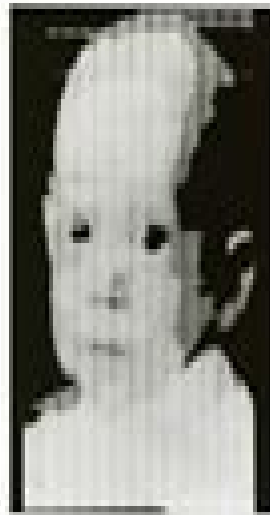
Naissance de la première photo numérique développée par l'équipe de l'américain Russell Krah 1957