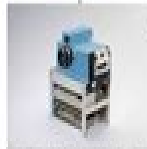
L'invention du premier appareil photo numérique par l'américain Steven Sasson 1975