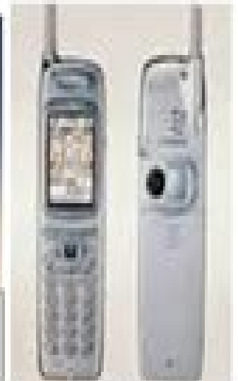
Les premiers téléphones portables avec un appareil photo intégré 2000