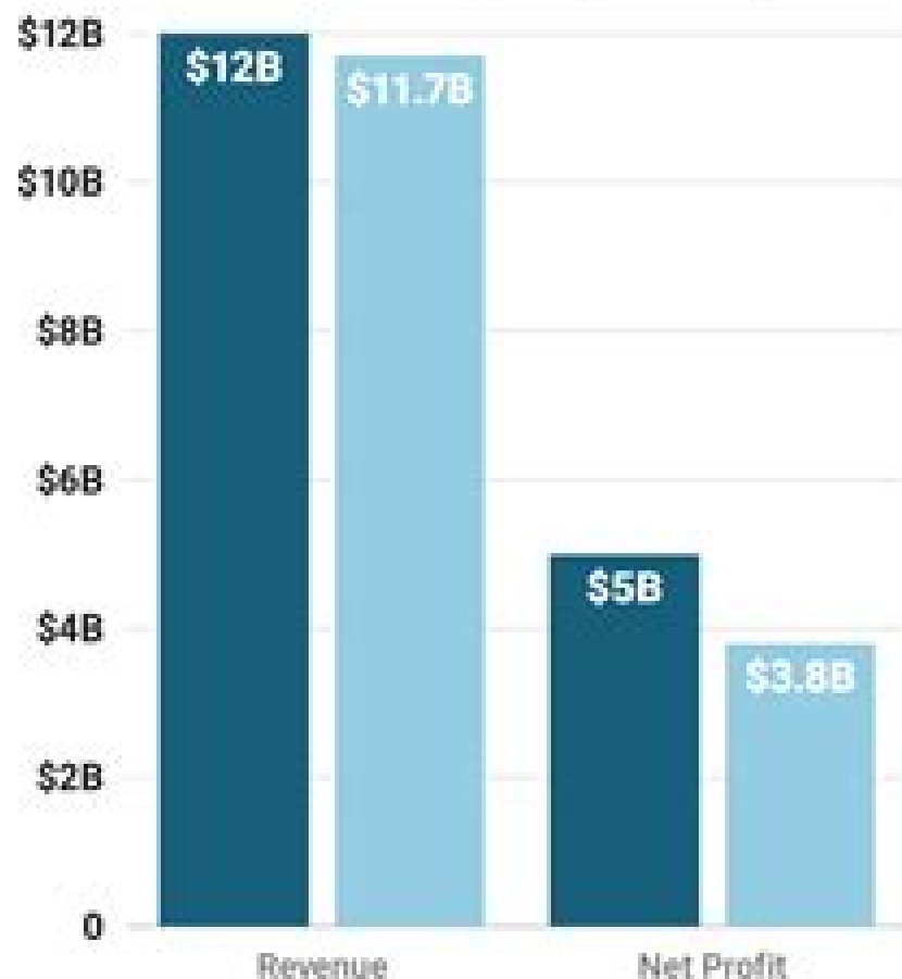
Revenue and net profit (Q1 2018)