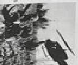
Combat in Vietnam

During the 1950s and 1960s, the United States helped another war against Communist forces in Asia—the Vietnam War. Vietnam is a country in Southeast Asia. It was divided into two sections—North Vietnam and South Vietnam. North Vietnam was controlled by Communists, and South Vietnam was controlled by a government friendly to the United States. The communists in South Vietnam wanted to take over South Vietnam.