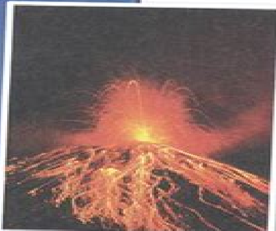
Volcano in Costa Rica (p. 2)