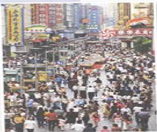
Nanjing Road, Shanghai, China (p. 81)