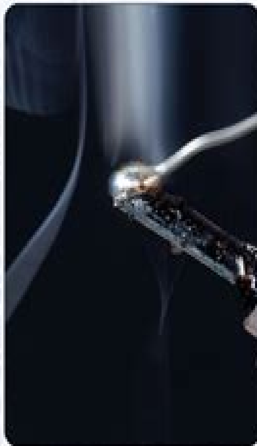
Tinning the tip