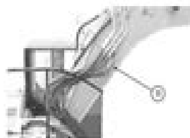
Diagram 1 g070440

Note: Cap all hydraulic lines and cap all hydraulic fittings that are disconnected in order to prevent oil loss. This will also keep contaminants out of the hydraulic system.