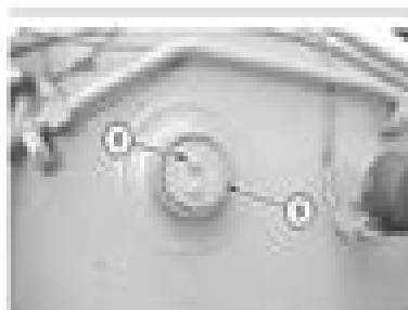
Diagram 1 g070112