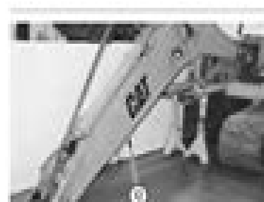
Diagram 1 g070441