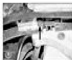
4.6d ... and the one each side under the wing (arrowed) ...