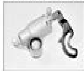
4.6o Timing belt tensioner (engine codes A6P, A6M, A6N and A6J)