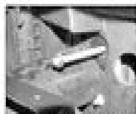
4.6a Tighten the power steering fluid nut supporting the bolt across