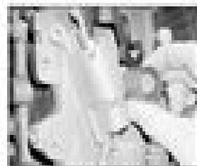
4.6n Remove the timing belt tensioner/roller (engine codes A6P, A6M, A6N and A6J)