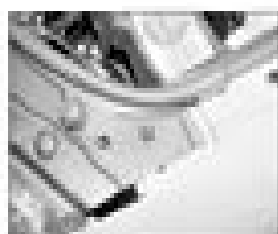
4.6e ... then remove the bolt each side of the top of the wing ...

into the cylinderhead channels (see illustrations)