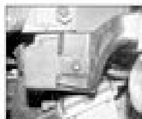
4.6f ... and the one alongside each headlight

8 If the timing belt is to be refitted, mark its