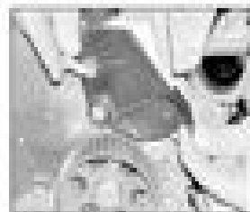
4.6m Remove the rear timing belt cover (tensioner codes A6P, A6M, A6N and A6J)

10 If the technician uses a special tool which engages the belt hole in the tensioner wheel, tensioner 10' works where an Allen key (long 400 mm) and a lever can be used. Turn the tensioner wheel clockwise as far as possible, then turn it slowly clockwise until the pointer is approximately 14.0 mm from the stationary mark. Continue to turn the tensioner until the two pointers are exactly opposite each other. Now tighten the nut to the specified torque (see illustration)