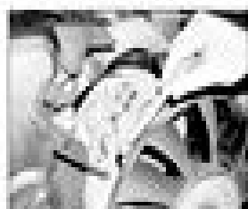
4.6h (Remove the bolts) ...