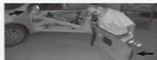
Outer door panels are removable for servicing components inside door cavity. 07 Doors and Central Locking