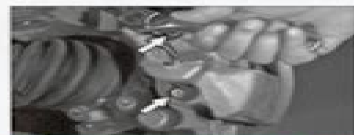
Detailed brake pad and rotor service procedure. 46 Brakes—Mechanical