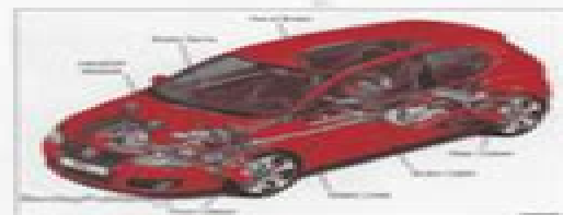
Suspension and brake components of GTI model. 02 Product Familiarization