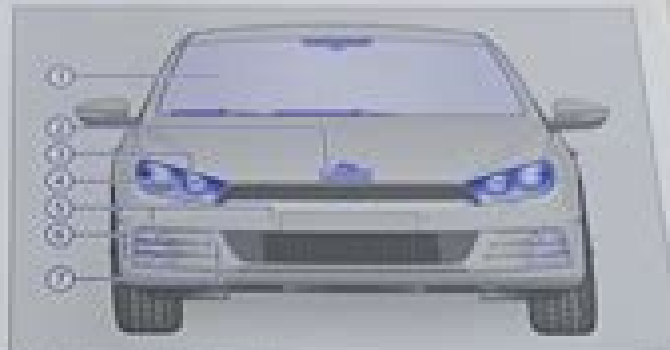
Fig. 2 Overview of the front of the vehicle