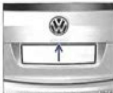
Abb. 24 Heckklappe von außen öffnen.

Lesen und beachten Sie zuerst die einschlägigen Informationen und Sicherheitshinweise auf Seite 52.