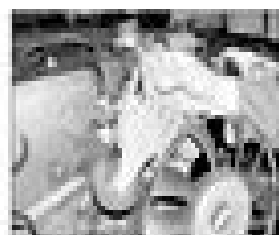
4.70b ... and remove the fan unit