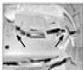
4.66 Bolt across and remove the bumper plate bolts under each headlight (arrowed) ...