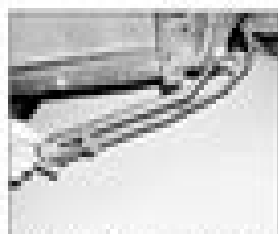
4.65 Insert the power steering bolt across