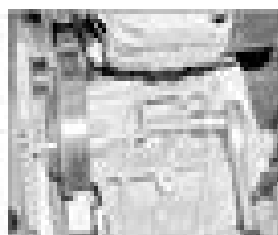
4.70a (Remove the bolt) ...