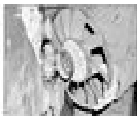
4.70c ... and remove the exhaust fan unit