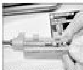
4.69a Separate the front section of the front intake valve