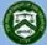
Department of the Treasury