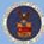
Department of Labor