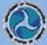
Department of Transportation