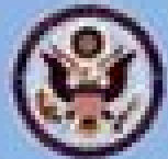
Department of State