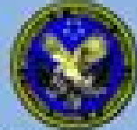
Department of Veterans Affairs