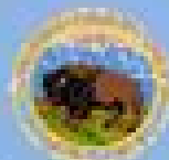
Department of the Interior