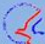
Department of Health and Human Services