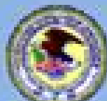
Department of Justice