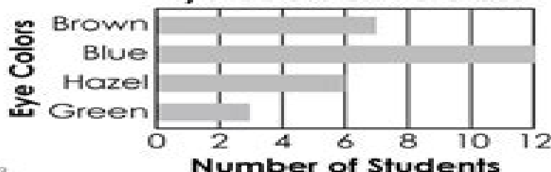
Eye Colors of the Class

19. Ally has 8 grapes. She eats 3. Then she gives 2 away. How many grapes does she have left?