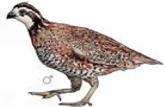
NORTHERN BOBWHITE QUAIL Colinus virginianus