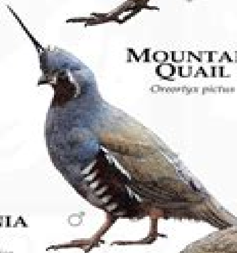
MOUNTAIN QUAIL Oreortyx pictus