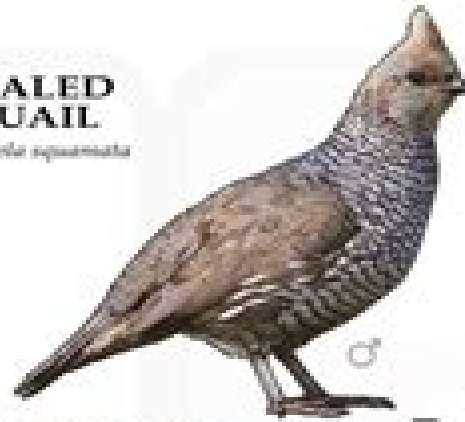
SCALED QUAIL Callipepla squamata