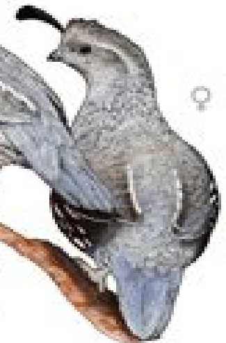
GAMBEL'S QUAIL Callipepla gambelii