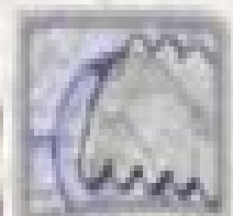
Stiff + Proud