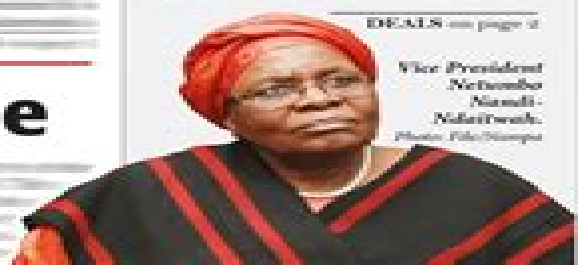
Vice President Netumbo Nandi- Ndaitwah.