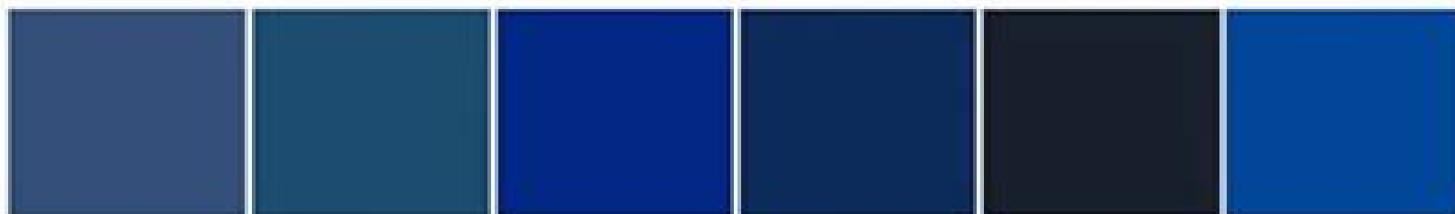
5000 Violet Blue