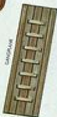
CANOPY (SEE PAGE 2)