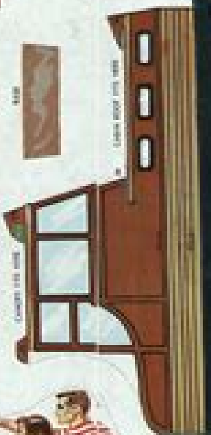
CABIN ROOF (SEE PAGE 2)