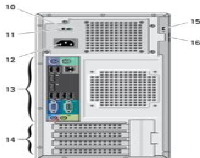
Figur 1. Minitårn sett forfra og bakfra