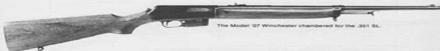
The Model '07 Winchester chambered for the .351 SL.