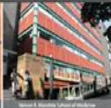
Nelson Mandela School of Management