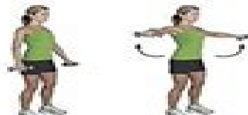
STANDING SIDE RAISE