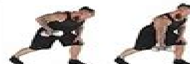
BENT OVER ROW