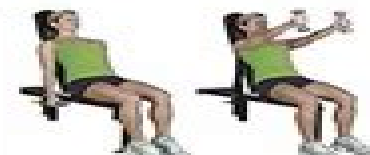
SEATED INCLINE DELTOID RAISE