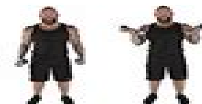
STANDING BICEP CURL