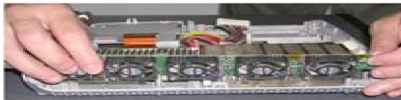
Figure 8-67 Removing the Fan Assembly